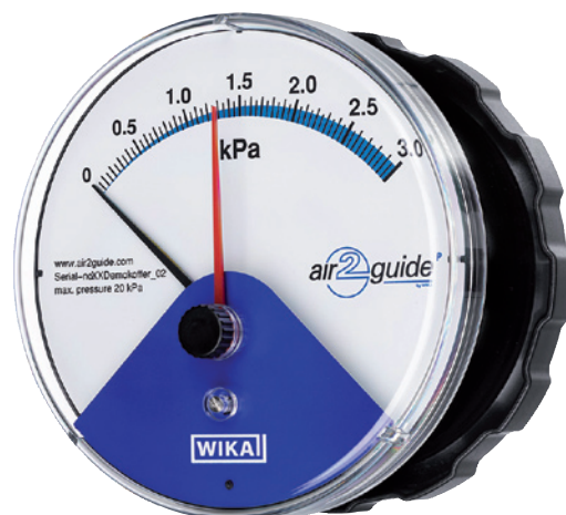
Differential Pressure Gauge air2guide P Model A2G-10