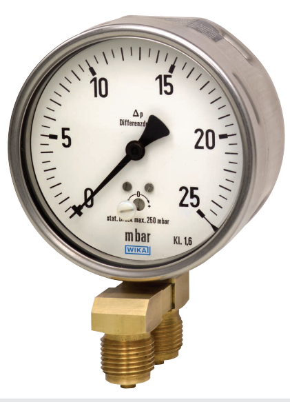
Differential pressure gauge model 716.11